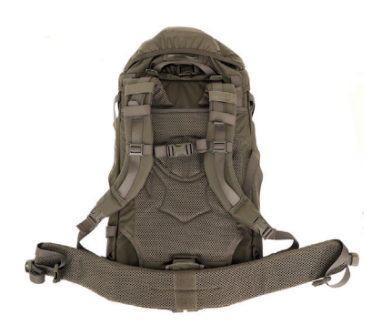
The hip belt can move with your hips and when you ditch the backpack, the hip belt with pouches stays on your body.