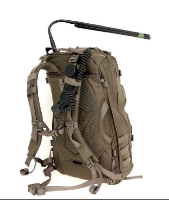
On the top there is a zipped opening for a radio antenna or a hydration system.