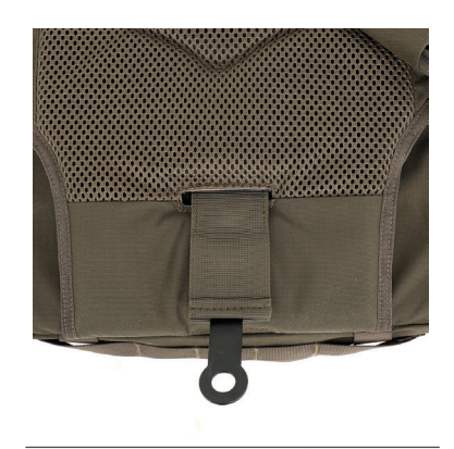
The Spoon sleeve and Curved long Spoon attached for a short/regular length back.