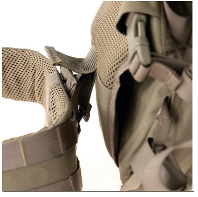
The Curved long Spoon is inserted into the Spoon garage.