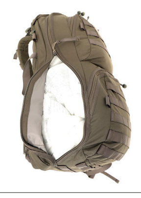
You can easily open just a part of the main zipper and access the backpack where ever you want.