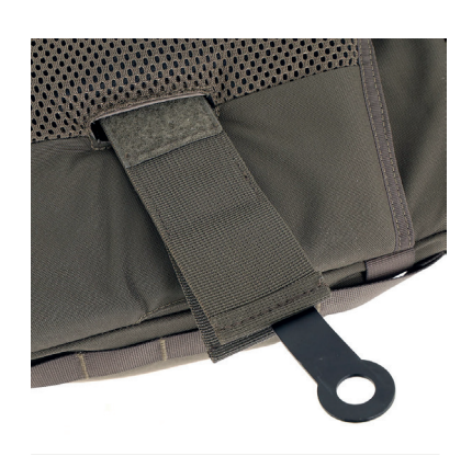
The Spoon sleeve with Curved long Spoon is inserted in the back of the backpack, in one of the slots. Adjust it to the proper height.