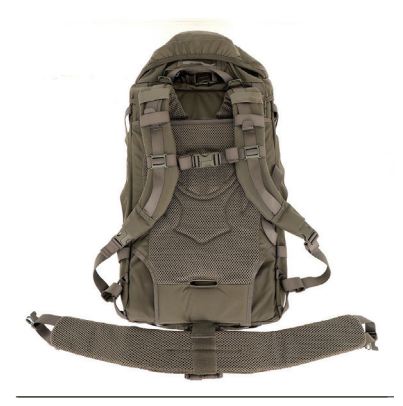
The Spoon sleeve and Curved long Spoon attached for a long length back