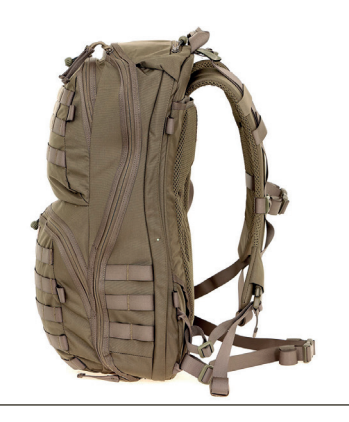
The back is shaped after your back to sit comfortably and to make it easier to carry body armour.