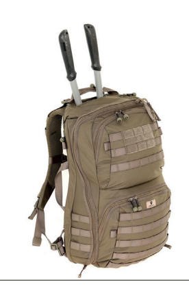
The zipped opening in the top can also be used to insert a bolt cutter.