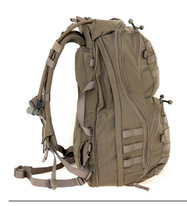
If needed, the backpack can be expanded from 30L to 40L capacity. Just open the zipper along the back.