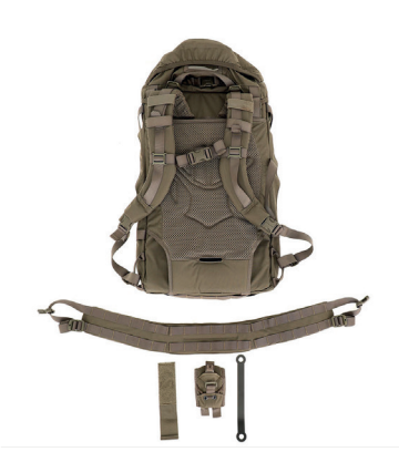
Snigels Spoon system can be used in this backpack. It gives you the possibility to use the hip belt as a combat belt and to ditch the backpack fast. Spoon sleeve, Curved long sleeve and a Spoon garage or double spoon garage.