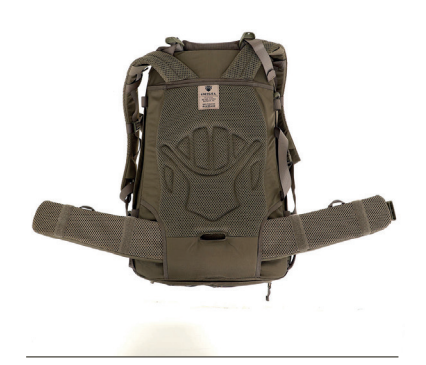
Snigels light combat belt can be used as a padded waist belt. Just insert it behind the mesh/fabric in the lower part of the back. The size can be adjusted by placing it in different heights.