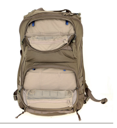
The exterior pockets each have one interior zipped compartment in mesh and one three slot compartment in elastic mesh. There are two loops in the lower pocket, blue to be easy to find, to secure gear.