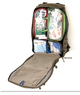
The back and front of the inside is covered with Velcro loop fabric. Inside pouches can be attached (not included).